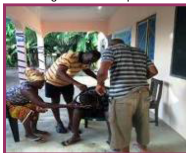
Patient with head wound

And patients keep on coming to the new Hope Homeopathy Health Clinic , often queuing for treatment for both acute and chronic health issues, so training more homeopaths is crucial.