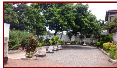
Entrance to PISHAM at North Kaneshie

In September 2015, the removal van left Iron City, Kasoa and stopped at Salaa Close, North Kaneshie. We have now moved into a soft and therapeutic environment with enough space to house the contents of our boxes and provide our school with enough rooms for teaching, a clinic, library, bookshop and more. Space for people too!