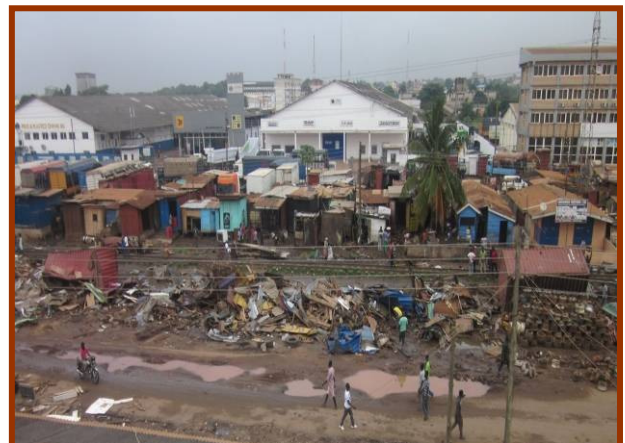
Fire/Flood Disaster Area at Circle in Accra

On June 3rd last year, there was a flood/fire disaster that devastated the Kwame Nkrumah Circle area in the centre of Accra. Rainfall during rainy season was much heavier than usual, plus a fire at a local petrol station led to loss of many lives, property and livelihoods in the area. Grace, the course leader, quickly got involved in supporting one of the communities by setting up an on-site outreach clinic, where she worked for six weeks. Grace provided homeopathic treatment for deep trauma, shock, separation and loss, to many individuals and their families. We hope never to have this experience in Ghana again.